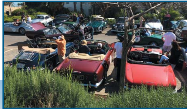
From the top: The humbling view from the Beresheet Hotel across the ancient lands of Mitspe Ramon. A remarkable collection of automobiles and an even more remarkable collection of license plates. The Americans: From the left are Sonoma and Will Clark's Porsche 356 C Cabriolet, Marcia and Ira Wagner's 280 SL and Patti and Pat's 220 SE.

We had just enough time to organize for a group photo and then the powers that be needed us to move on. Again, we had a police escort as we drove out of the old city and departed from Jerusalem. We spent the morning driving many different small, winding hilly